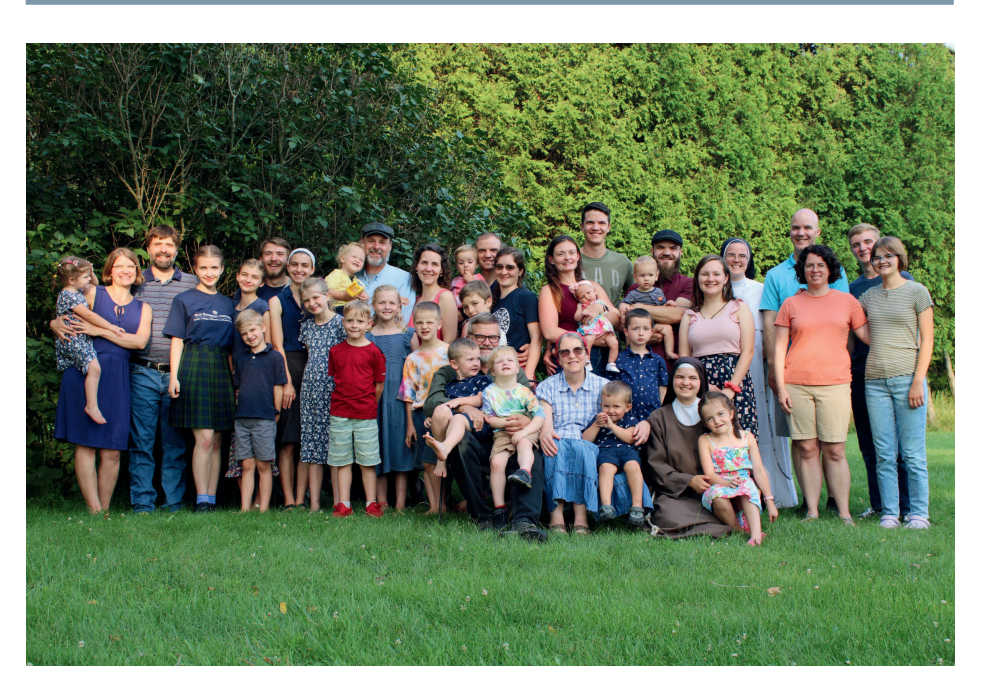
Hill Family members attended Catholic Masses throughout the week on their family reunion vacation in Erie, Pennsylvania. The churches they visited were Saint Hedwig, Saint Matthias, and Saint Boniface.