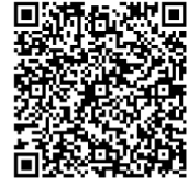
Confirmation Prep Form

SAVE THE DATE! HOLY FAMILY & SAINT JOHN'S ANNUAL