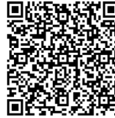
Faith Formation Form

REGISTRATION DUE NOW! PLEASE COMPLETE ASAP!