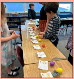
Students in grades 3-4 had a Resurrection Egg Hunt to discuss Jesus' journey from Palm Sunday to Easter Sunday!